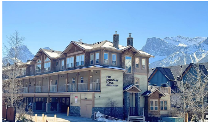
WELCOME TO UNIT 206 AT 121 KANANASKIS WAY

The condo is seconds away from The Shops