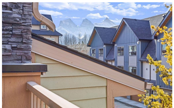
VIEW OF THE THREE SISTERS FROM THE LARGE DECK