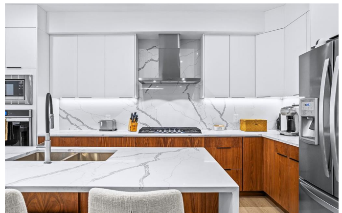
THE CHEF-INSPIRED KITCHEN IS AN ABSOLUTE SHOWSTOPPER